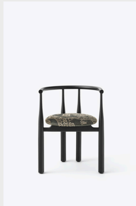
Item No: 41811 Variant: Black w. Upholstery