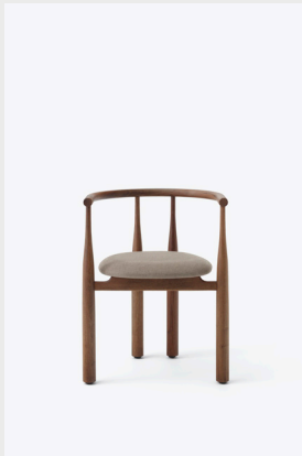
Item No: 41810 Variant: Walnut w. Upholstery