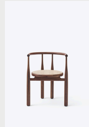
Item No: 41820 Variant: Walnut w. French Cane