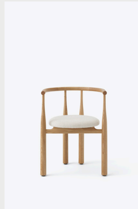
Item No: 41812 Variant: Oak w. Upholstery