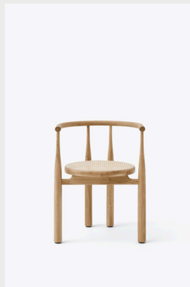
Item No: 41822 Variant: Oak w. French Cane