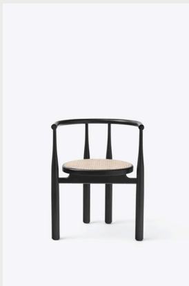
Item No: 41821 Variant: Black w. French Cane